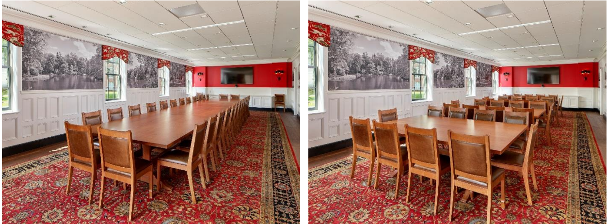
The room's layout is completed much faster with stacking chairs – seen here in the function room at the Lawrenceville School

Your facilities likely include rooms that must be rearranged for different events, which can seem a monumental task to perform again and again. You might also face difficulty when it comes time to deep clean the floors of your area, as juggling the seating around can cause a headache. Simply put, librarians face a lot of stress on the job, and we try to help alleviate that in what ways we can. With our line of stacking hardwood chairs, you don't have to sacrifice the elegance and warmth of wood for ease of convenience.